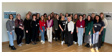
WAVE North Europe Regional Meeting