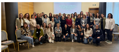
WAVE South-East Europe Regional Meeting

From 2–4 April, 31 representatives of WAVE member organisations from North Europe met in Riga, Latvia , for a dynamic regional meeting, co-organised by the Women's NGOs Cooperation Network of Latvia ( Latvijas Sieviešu nevalstisko organizāciju sadarbības tīkls ). A week later, from 9–11 April, 40 representatives of WAVE member organisations from South-East Europe gathered in Split, Croatia , with the inspiring meeting co-hosted by domine – Organization for the Promotion of Women's Rights ( domine – Organizacija za promicanje ženskih prava ). Both events provided valuable opportunities to exchange regional priorities, ranging from political developments and feminist organising to tackling emerging forms of violence against women and girls.